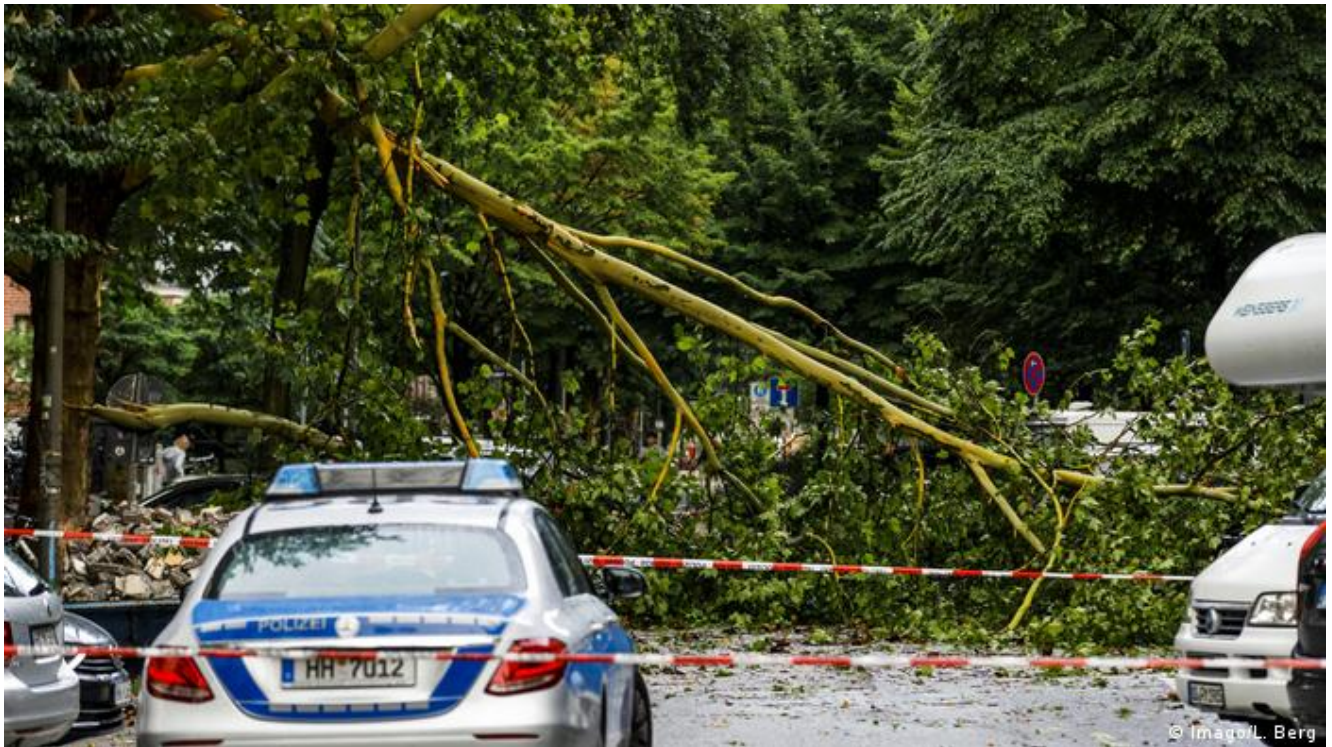
Damaged trees in Hamburg

Early Friday, DB told passengers they should expect further delays because of the damage caused by the storm. Long distance trains covering the Hanover-Hamburg-Kiel, Bremen-Hamburg and Osnabrück-Löhne routes were not operating on Friday morning.