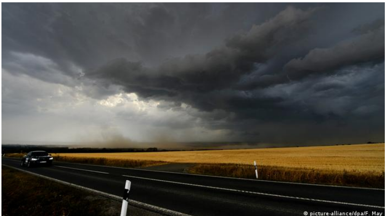
Storm clouds over Mühlhausen in Thuringia

In Thuringia, sudden strong winds on dry soil from a field reduced visibility on the east-west A4 artery to less than 20 meters for a short period.