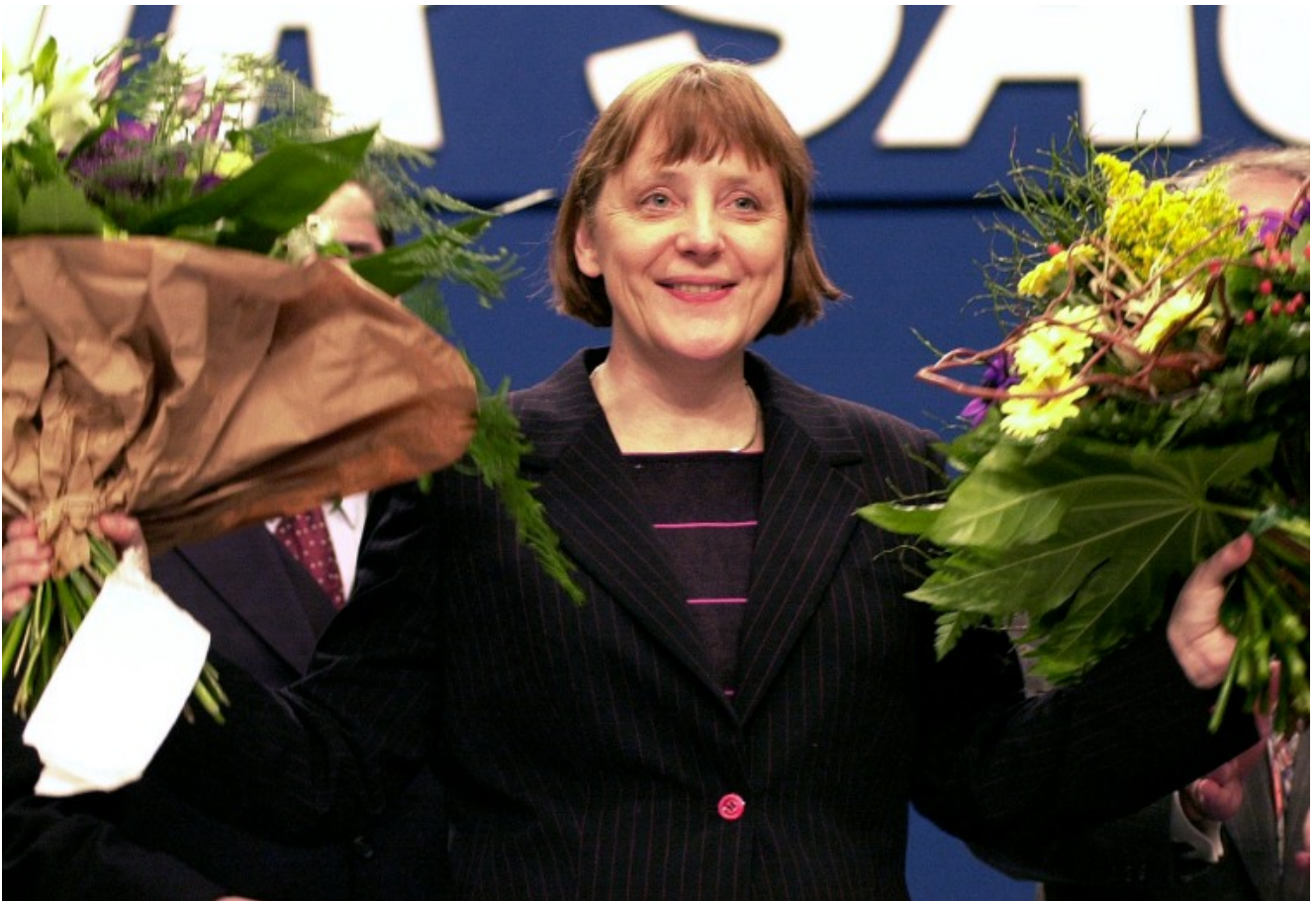
Angela Merkel after being elected as CDU leader on April 4, 2000.

Jens Spahn, Germany's 38-year-old health minister, repeatedly spoke out against Merkel's open-door migration policy which resulted in the arrival of nearly a million refugees.