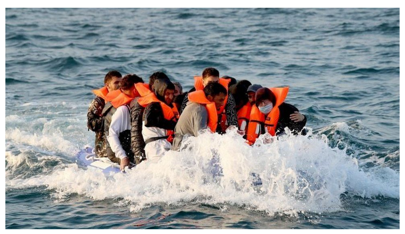
Many people-smugglers send asylum seekers across the Channel in dangerously small boats