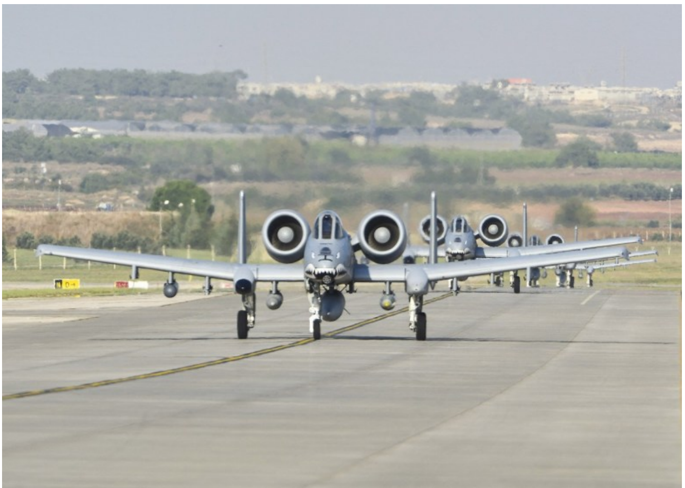
A row of 10 Thunderbolt II planes, also known as 'tank killers,' at the Incirlik Air Base in Adana, Turkey, on October 22, 2015.

This has long infuriated most Armenians, for whom the catastrophic events of those years shaped much of their present identity - and constitute a major barrier to any reconciliation between Armenia and Turkey.