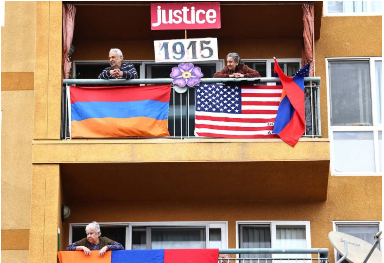
Armenia supporters watch from a balcony during a rally in Hollywood commemorating the 106th anniversary of the Armenian genocide on April 24, 2021, in Los Angeles, California.