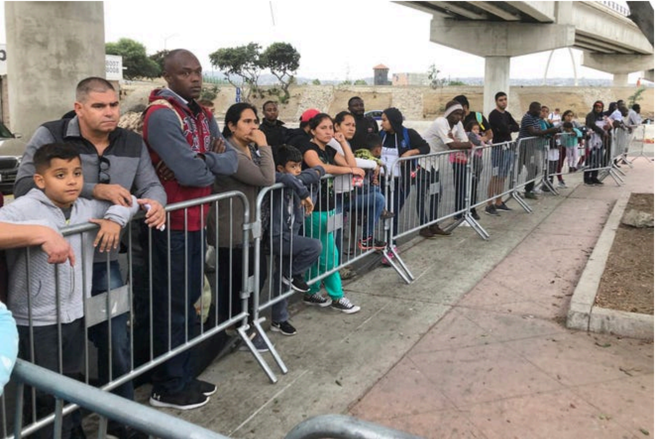
Asylum seekers in Tijuana, Mexico, listen to names being called from a waiting list to claim asylum at a border crossing in San Diego on Sept. 26, 2019.