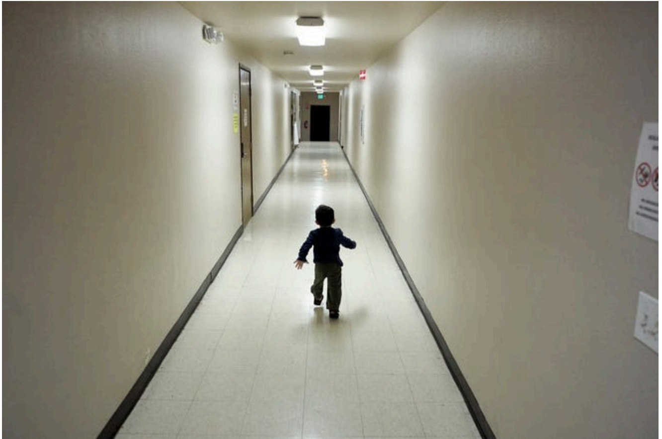
An asylum-seeking boy from Central America runs down a hallway after arriving from an immigration detention center to a shelter in San Diego on Dec. 11, 2018.

The Trump administration has tried a variety of tactics to limit or halt asylum requests along the southern border, with federal judges striking down several of them. But they have been forging ahead on their goal of redefining, and limiting, who can apply for asylum in the United States.