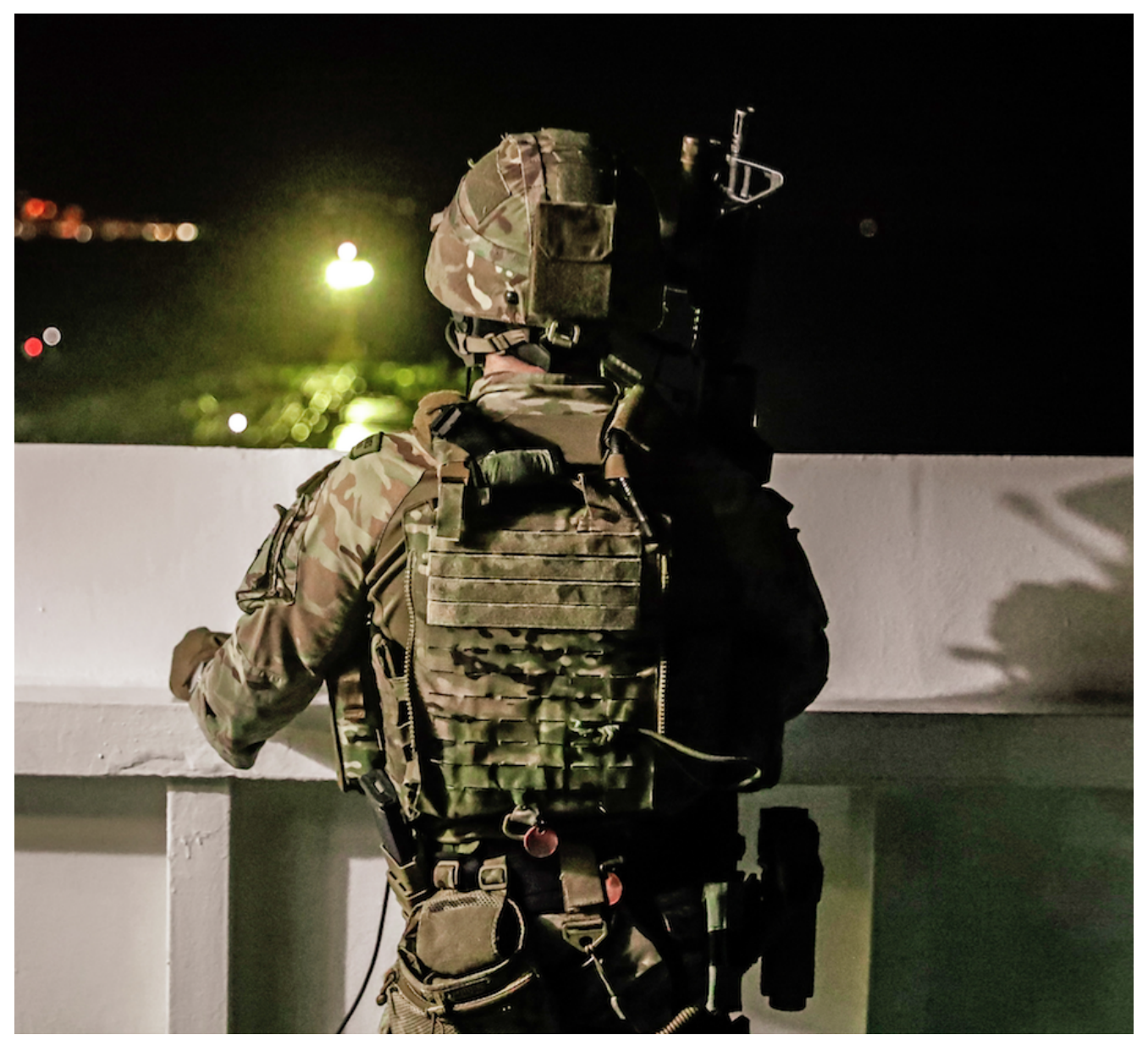
Gibraltar tanker seizure

Royal Marines were hailed for the "brave" and "bold" operation to seize the tanker suspected of carrying oil destined for the cruel regime of Bashar al-Assad.