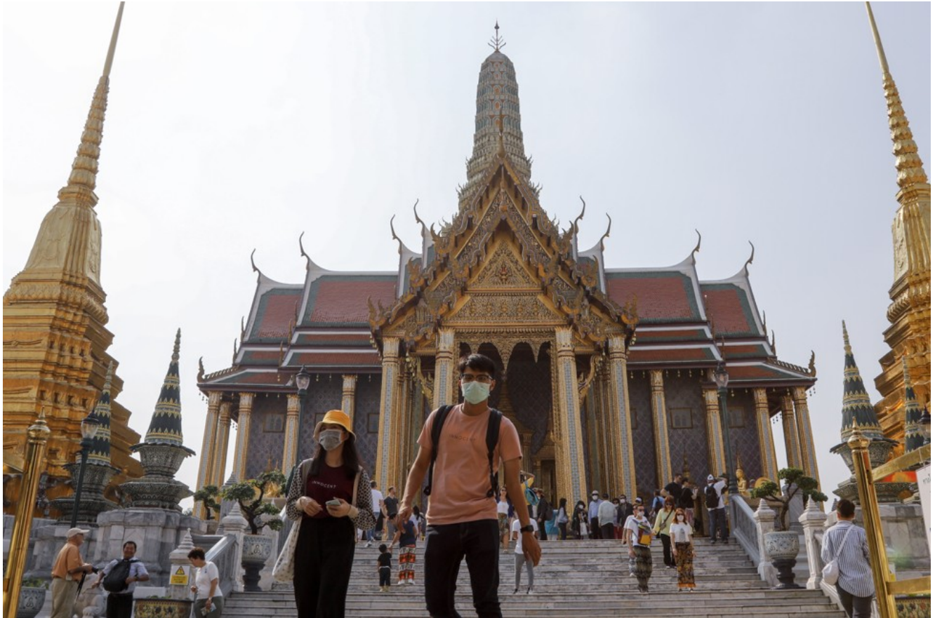
Mask-clad tourists visit the Grand Palace in Bangkok on February 1, 2020.

Vietnam [27] has closed its land border with China. Thailand [28] has not placed any travel restrictions on mainland Chinese tourists [29], a move that has sparked internal debates within its Cabinet.