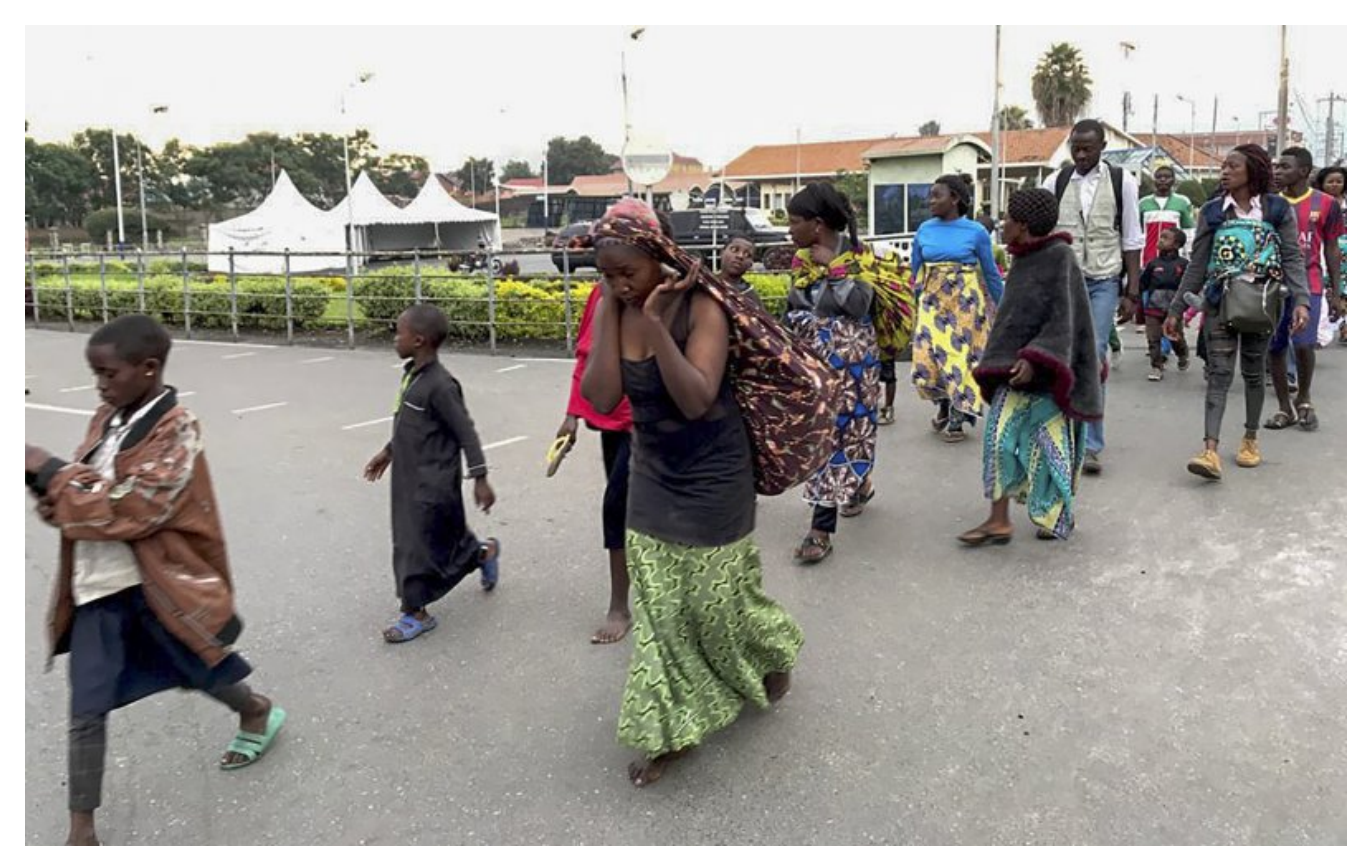
Congolese residents of Goma arrive in Rwand Sunday after fleeing from Mount Nyiragongo volcano as it erupted over Goma Saturday.

May 25 (UPI) — The search continued Tuesday for more than 100 children missing since the Mount Nyiragongo volcano eruption in the Democratic Republic of Congo.