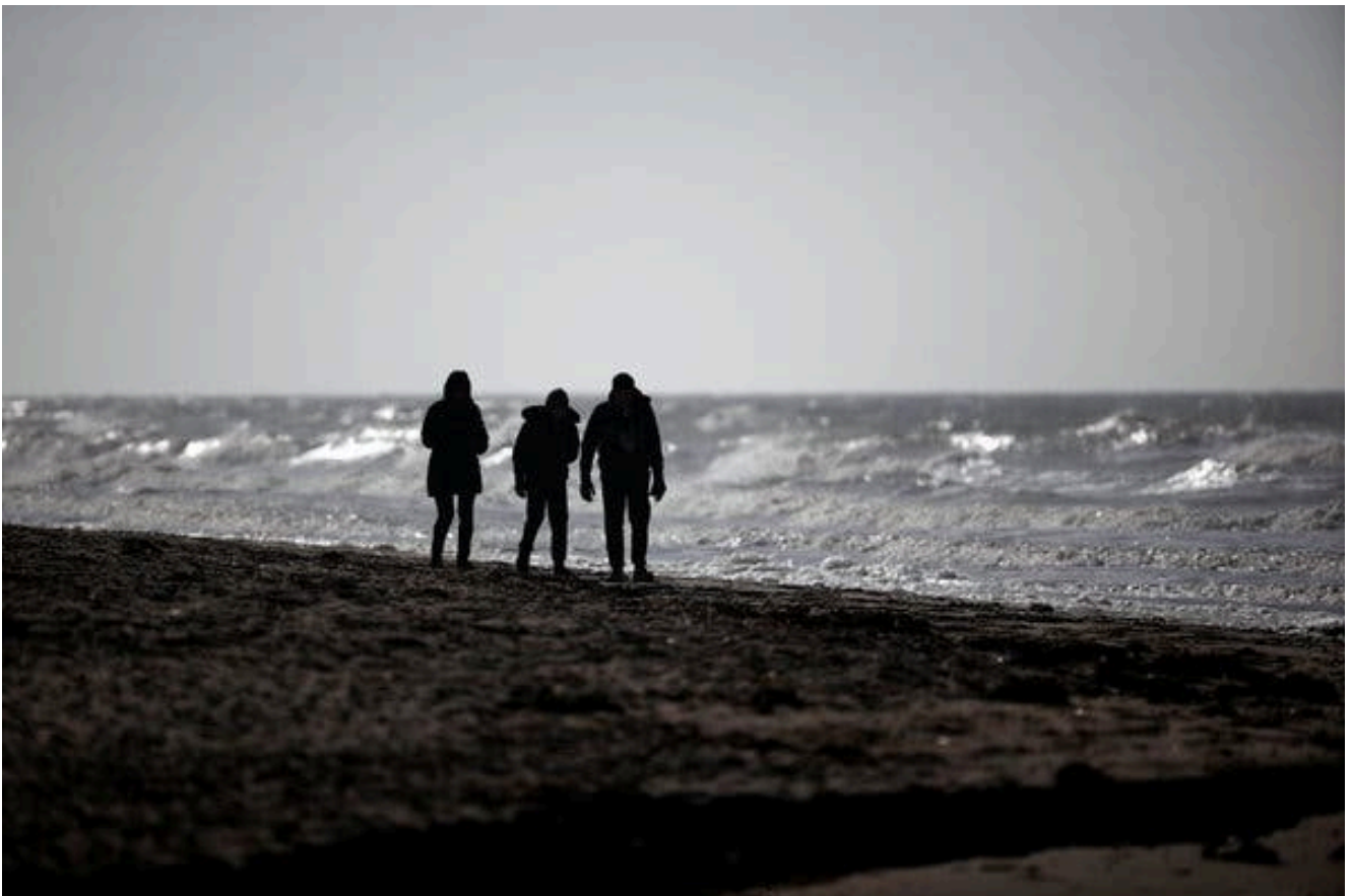
A beach near Calais, a northern French port city that has been a flashpoint over immigration.

Mr. Macron’s government has increasingly adopted arguments that some migrants are exploiting France’s welcome of asylum seekers, who can quickly qualify for health care and other benefits.