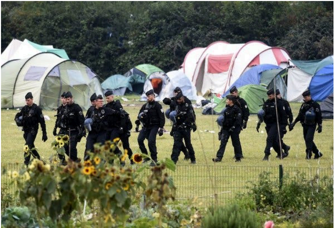
The evacuation of a migrant camp in northern France in September.

The authorities have regularly expelled migrants from specific sites, leading them to move elsewhere, in a continuing cat-and-mouse game.