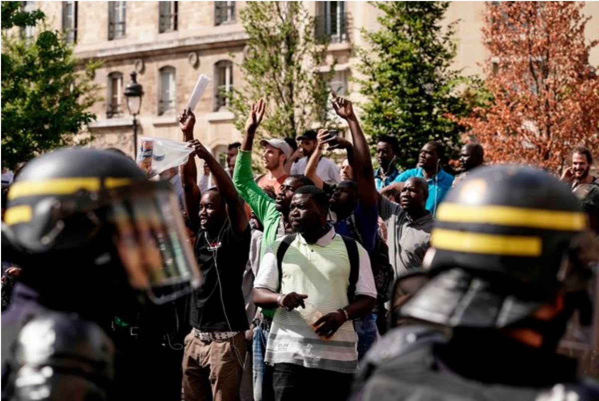
Macron Aims to Keep Migrants, and Far Right, at Bay in France – Feb. 22, 2018