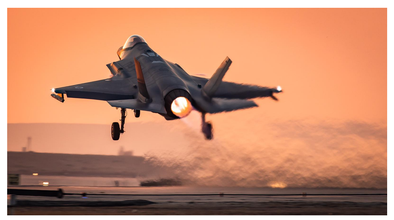
An F-35 fighter jet takes off during a surprise exercise, 'Galilee Rose,' in February 2021.

The Israeli Air Force completed a three-day surprise exercise simulating a largescale war with Hezbollah this week, including mock strikes on some 3,000 targets in one day, the military said, in a clear threat to the Lebanese terror group.