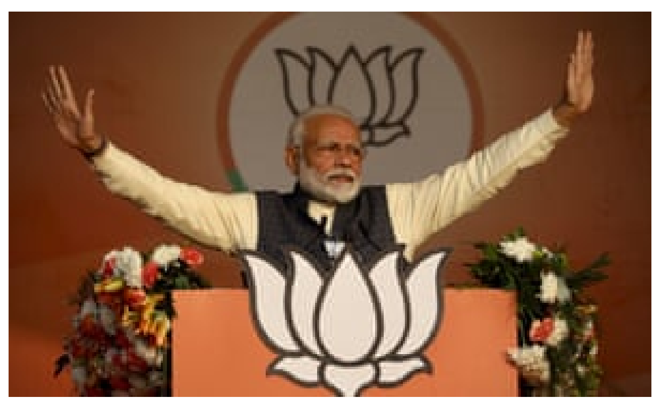
India's Narendra Modi addressing the BJP campaign rally ahead of Delhi state elections in New Delhi earlier this year.

Previous governments, as well as India's supreme court, had agreed that a citizens' register was necessary to distinguish migrants from locals. Citizenship isn't always simple to prove in India; in a country of more than 1 billion people, fewer than 100 million hold passports, while other documents, issued at local levels by corrupt or inefficient officers, can be unreliable. For the BJP, the idea of a citizen's register served as both a profitable electoral tactic and a religious wedge. In a stump speech in 2014, Modi told an audience in Assam that while Hindu migrants would be accommodated, other "infiltrators" would be sent back to Bangladesh. In April 2019, Amit Shah, now Modi's home minister, said that Bangladeshi immigrants were "eating the grain that should go to the poor". They were "termites", Shah added. The BJP would pick them up, one by one, and "throw them into the Bay of Bengal".