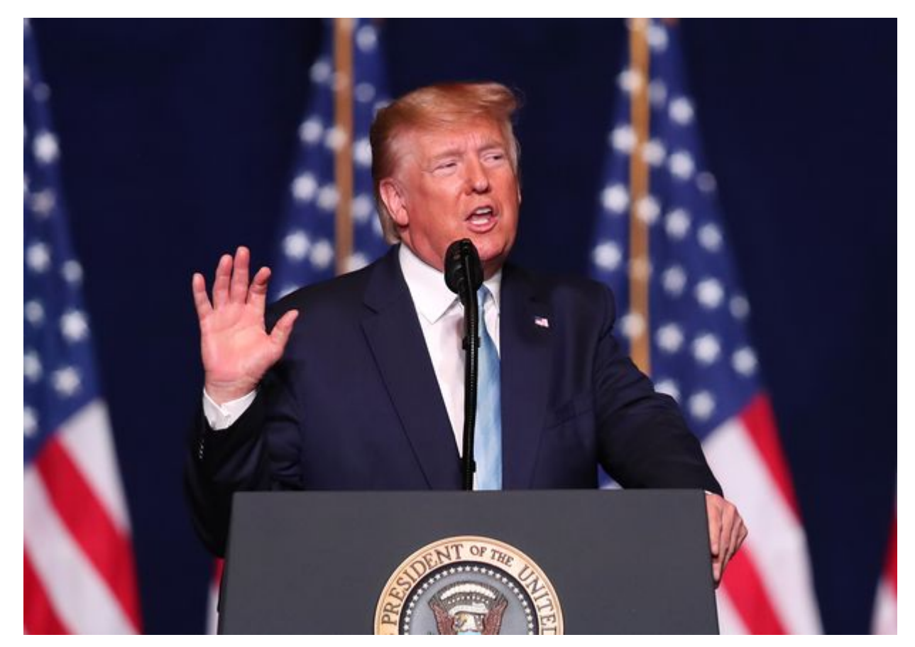
An $80million bounty has been put on Trump's head

The attack took long-running hostilities between Washington and Tehran into uncharted territory and raised the spectre of wider conflict in the Middle East.