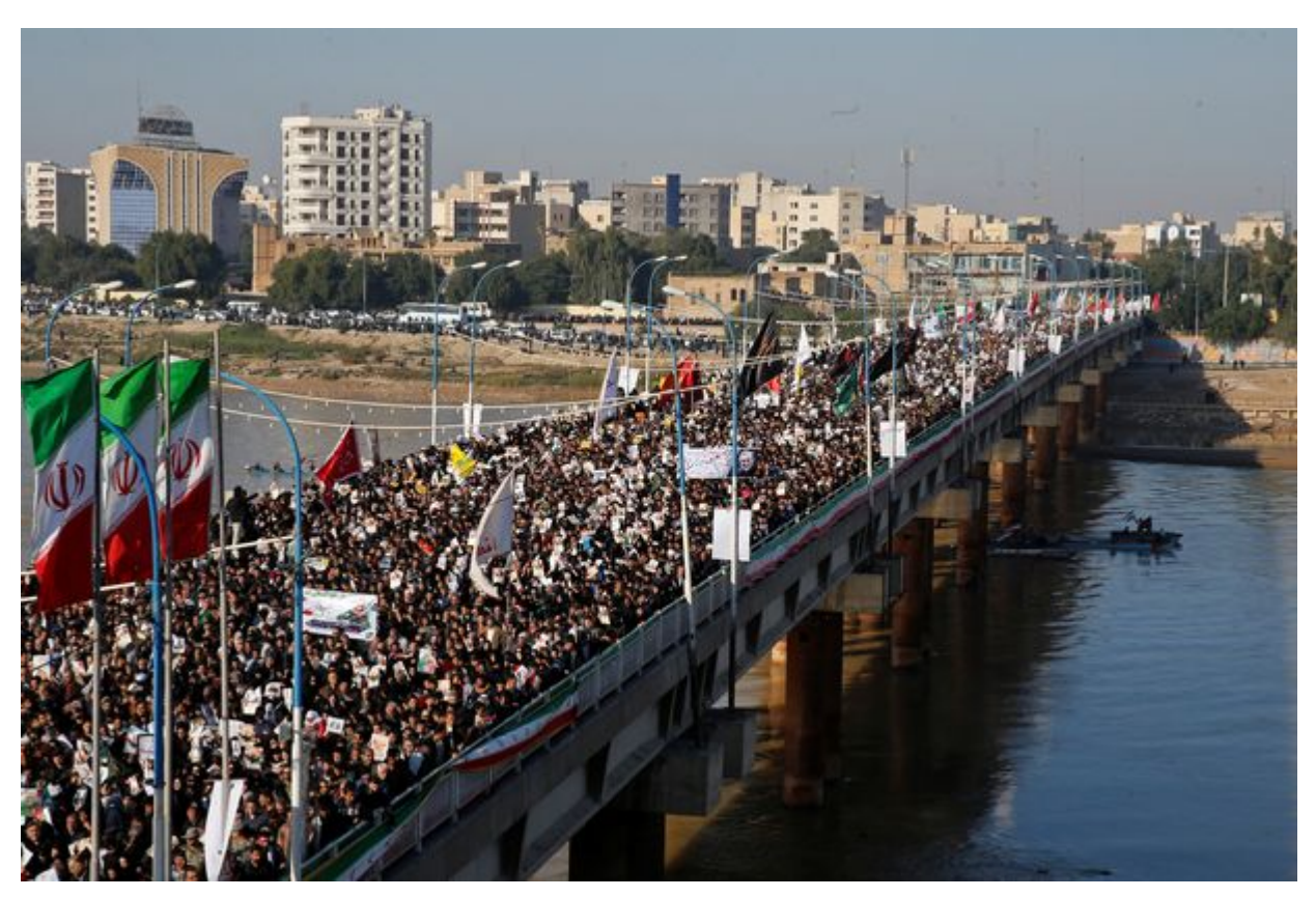
Thousands of mourners attend a funeral procession for Soleimani

He went on to say that "this is a declaration of war, which means if you hesitate you lose.