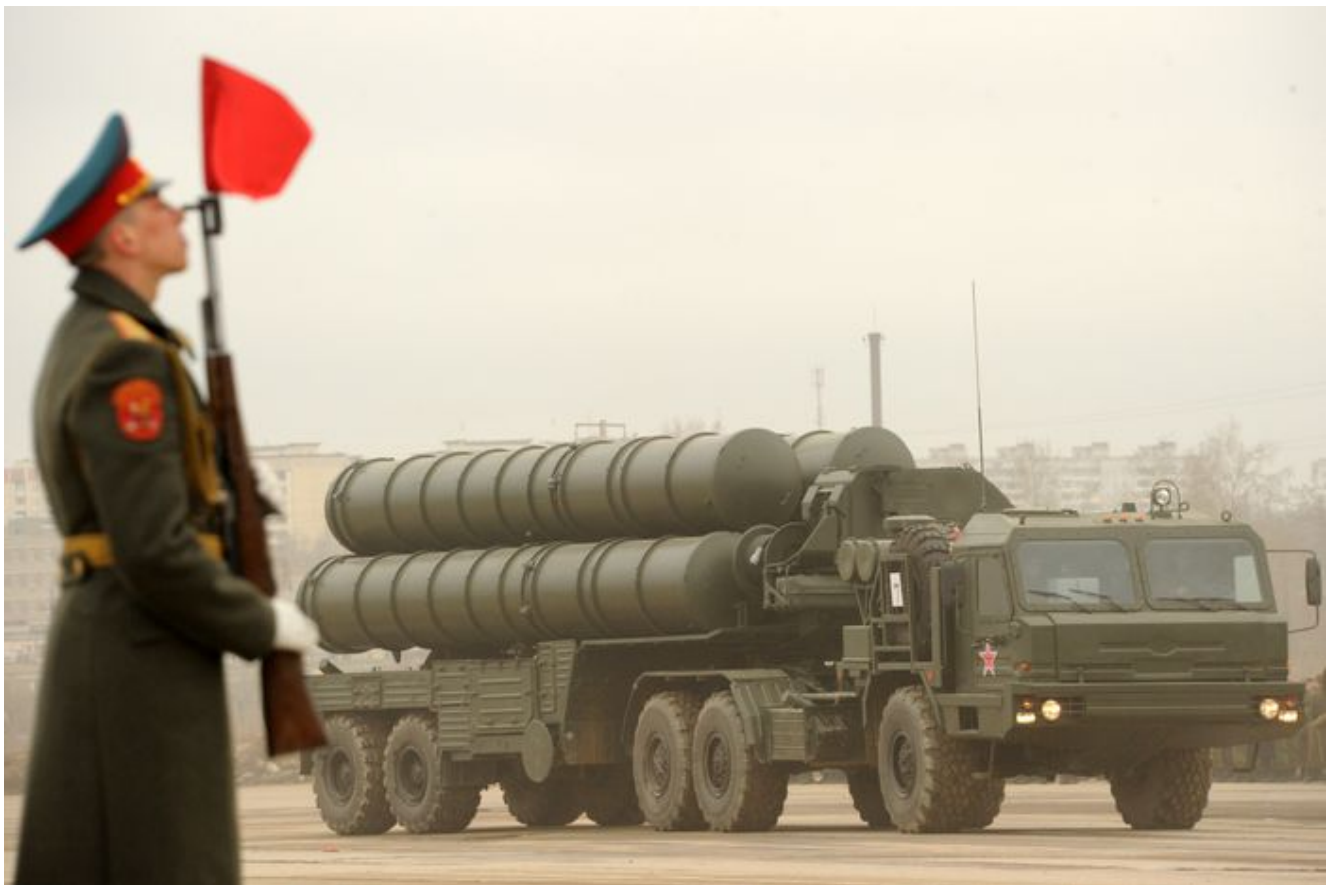
A Russian S-300 PMU2 Favorit surface-to-air missile system in Alabino, outside Moscow, last year.

“A few years ago at the request of our partners, we decided not to supply S-300’s to Syria,” Lavrov said in an interview with the BBC . “Now that this outrageous act of aggression was undertaken by the US, France and UK, we might think how to make sure that the Syrian state is protected.”