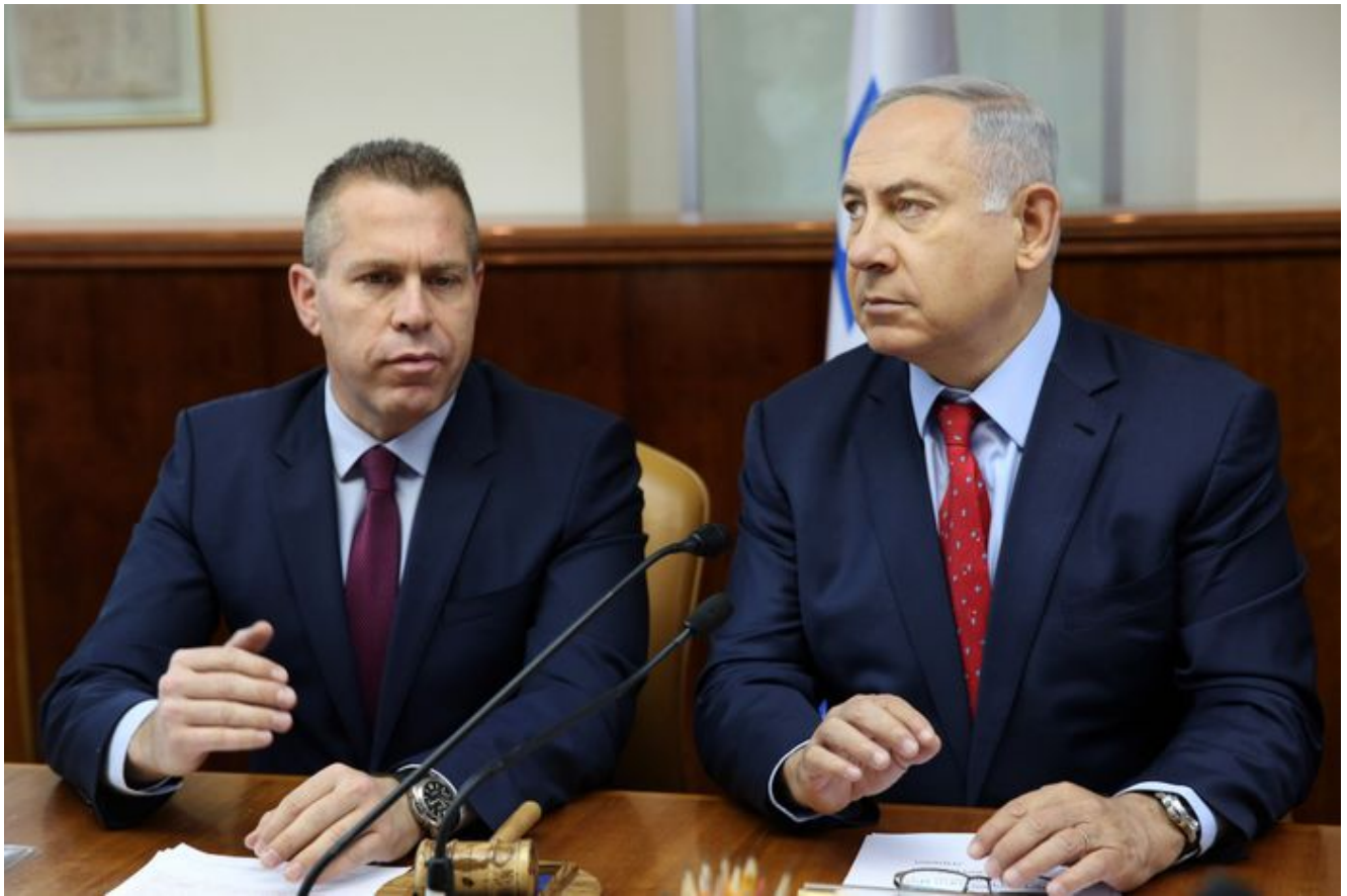
Israeli Prime Minister Benjamin Netanyahu, right, sits next to Israeli Public Security Minister Gilad Erdan during the weekly cabinet meeting in Jerusalem, Sunday, April 10, 2016.

On Thursday afternoon, a weak 3.1 magnitude quake sent tremors across the Galilee region, hours after two separate 3.2 magnitude quakes struck north of the city of Tiberias.