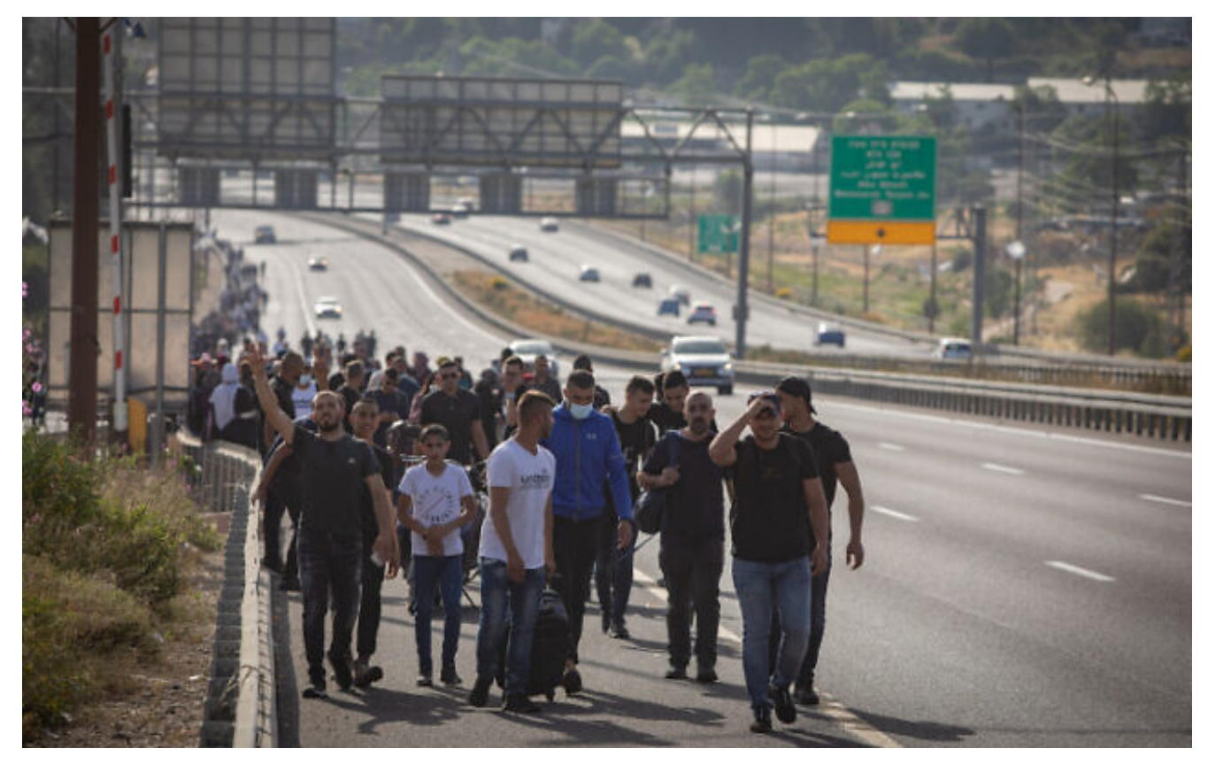
Hundreds of Arab Israelis marching on Route 1 making their way to Jerusalem, May 8, 2021

The Israel Defense Forces, Shin Bet security service, and Israel Police have struggled to contain the violence and have enjoyed little assistance from the political echelon in attempting to do so, with Israeli lawmakers failing to cooperate with one another as the various parties struggle to form a government coalition.