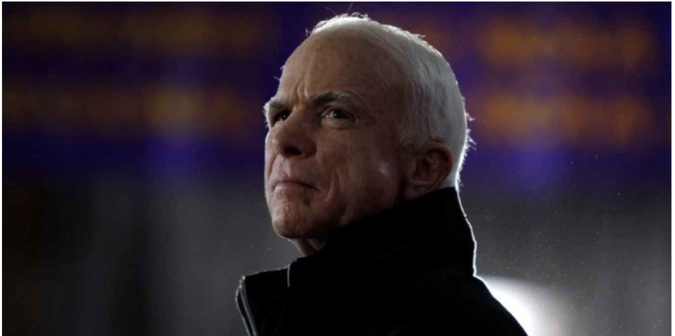
Sen. John McCain.