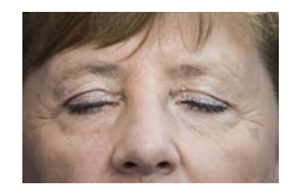
MERKEL CRISIS: Pressure mounts as German chancellor faces D-DAY

The Greens will be the big winner in the federal state, the poll showed, jumping into second place with 22 percent support, right after the CDU.