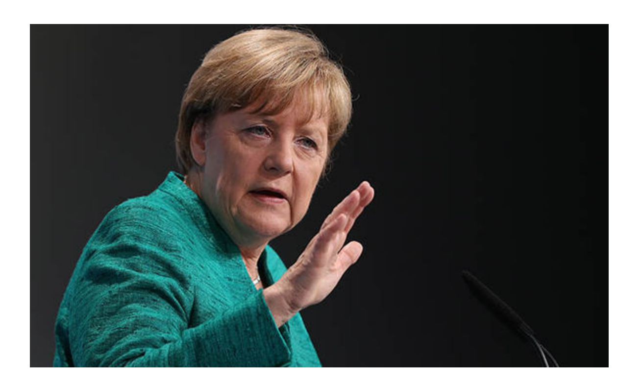
Angela Merkel's party looks set to lose 12 percent of the seats at the October 28 elections