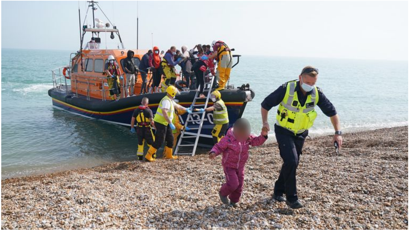
Children were seen being brought off the small boat

Across the water, French authorities rescued a four-year-old child among 23 people on board an inflatable boat that had got into difficulty after suffering engine damage.