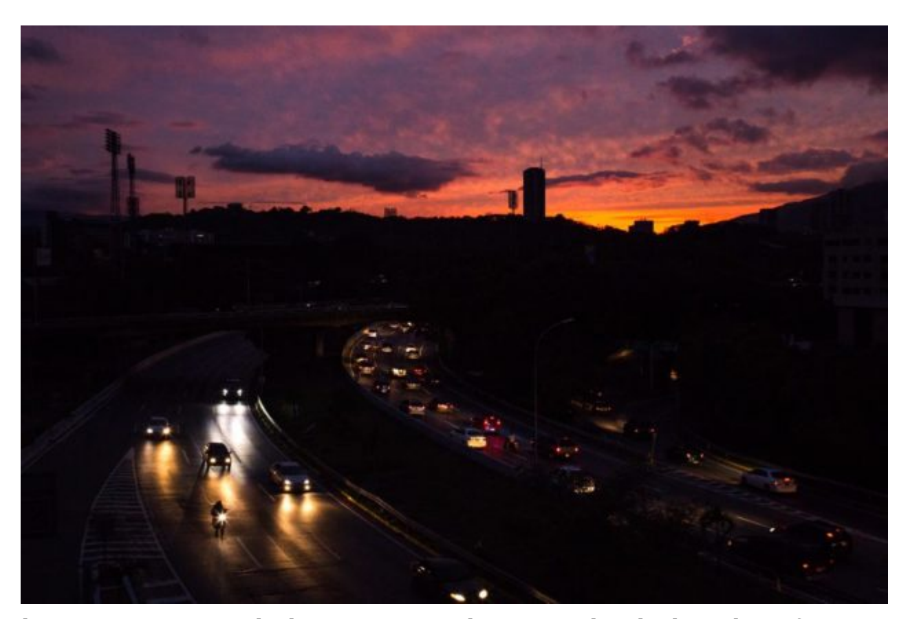
The sun sets over a dark Caracas. - 4th Venezuela Blackout

Around midnight, power returned to several areas affected, Caracas included. However, electricity is failing again this morning in the Venezuelan capital, much like an earthquake's aftershocks.