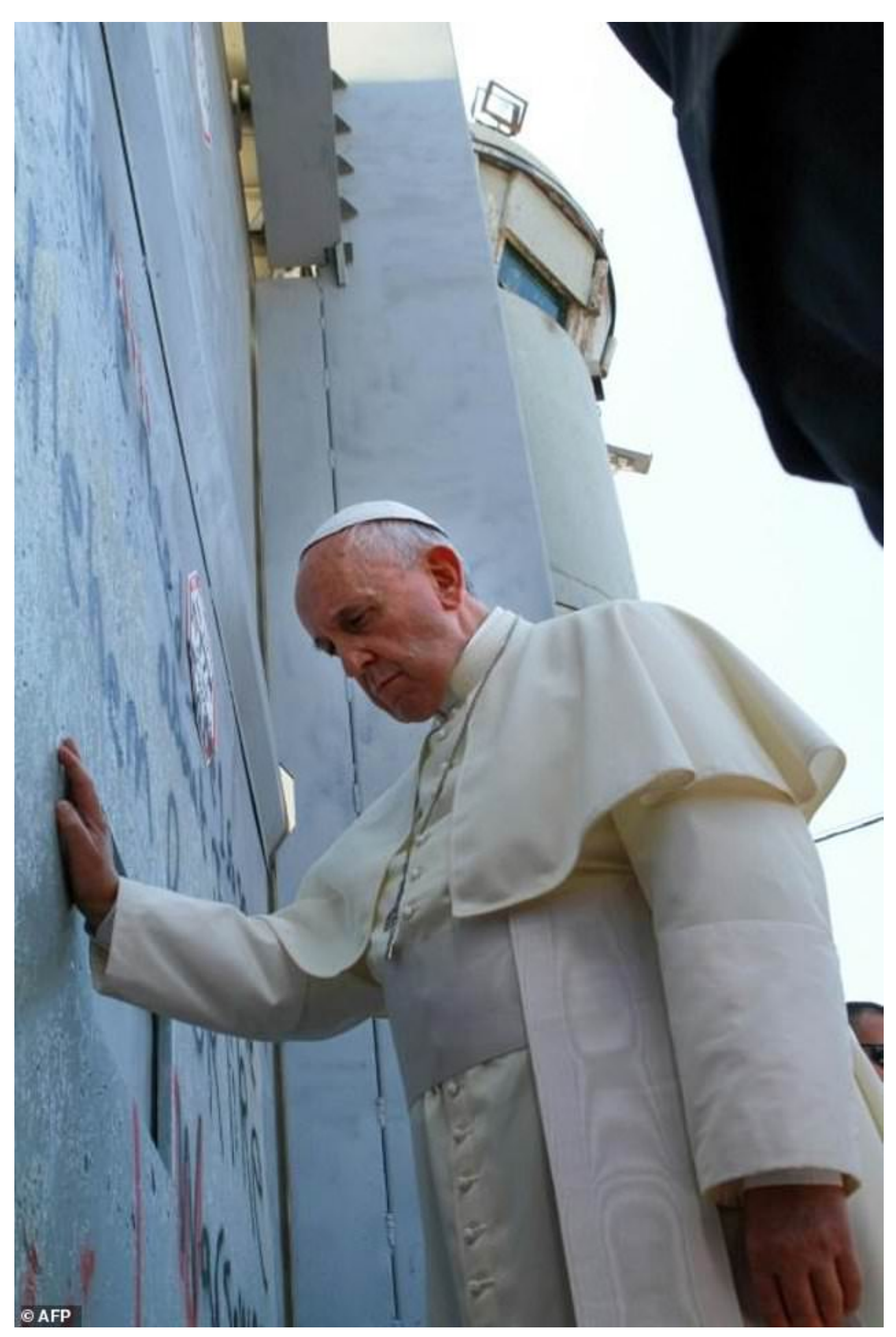
Pope Francis prays at Israel's separation barrier with the West Bank at