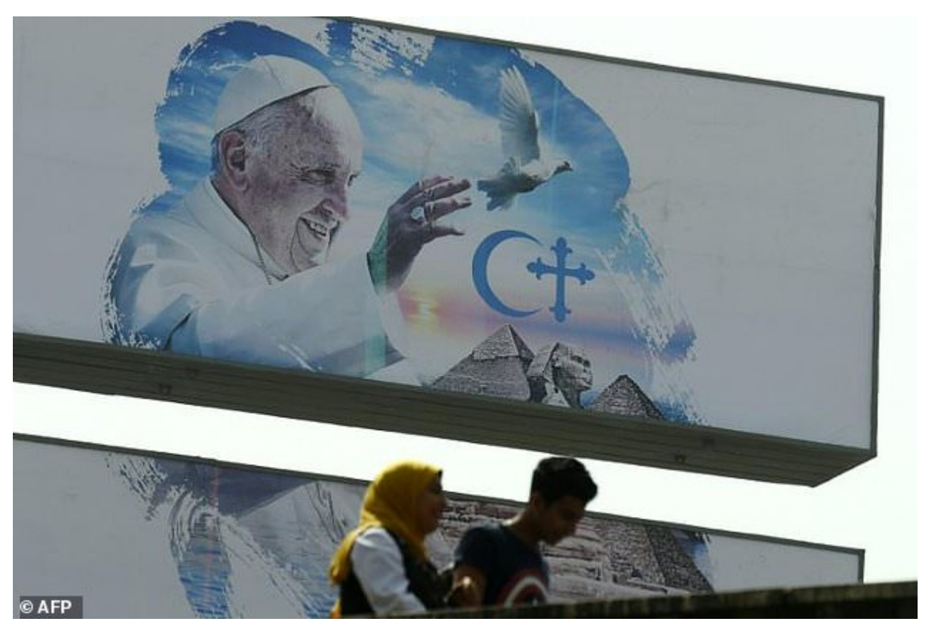
A poster welcomes Pope Francis to Egypt in 2017

In April 2017 Francis pays the second papal visit to Egypt of modern times, 17 years after that of pope John Paul II.