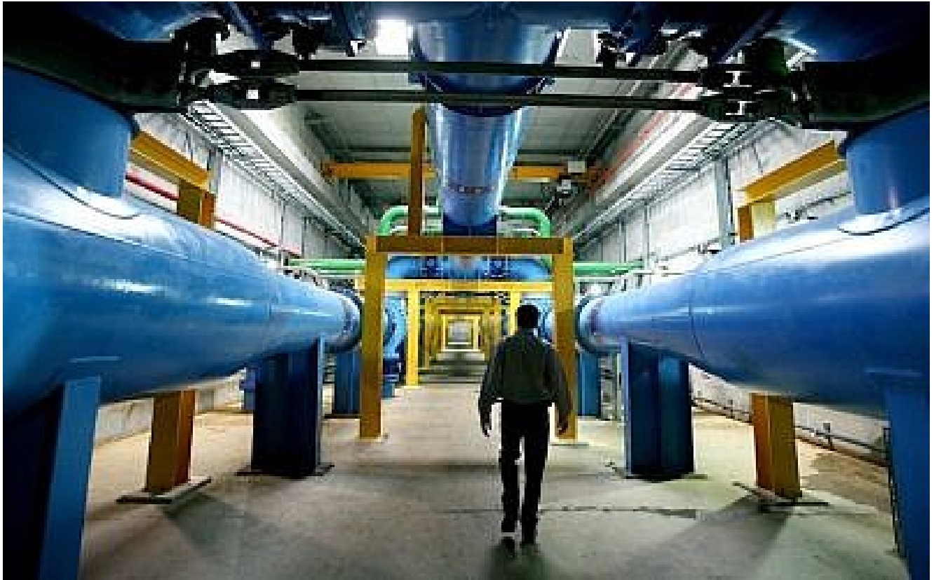
View of the Eshkol Water Filtration Plant in Northern Israel

Ultimately, the alleged Iranian cyberattack caused minimal issues, according to Israeli officials.