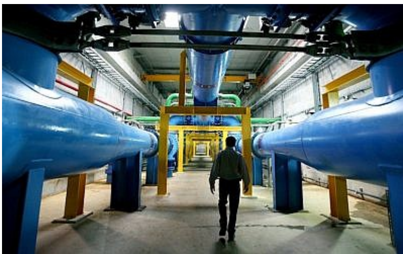
View of the Eshkol Water Filtration Plant in Northern Israel (Moshe

The alleged Israeli attacks also came amid an ongoing campaign of so-called maximum pressure by the United States in the form of crushing sanctions on Iran and Iranian officials.