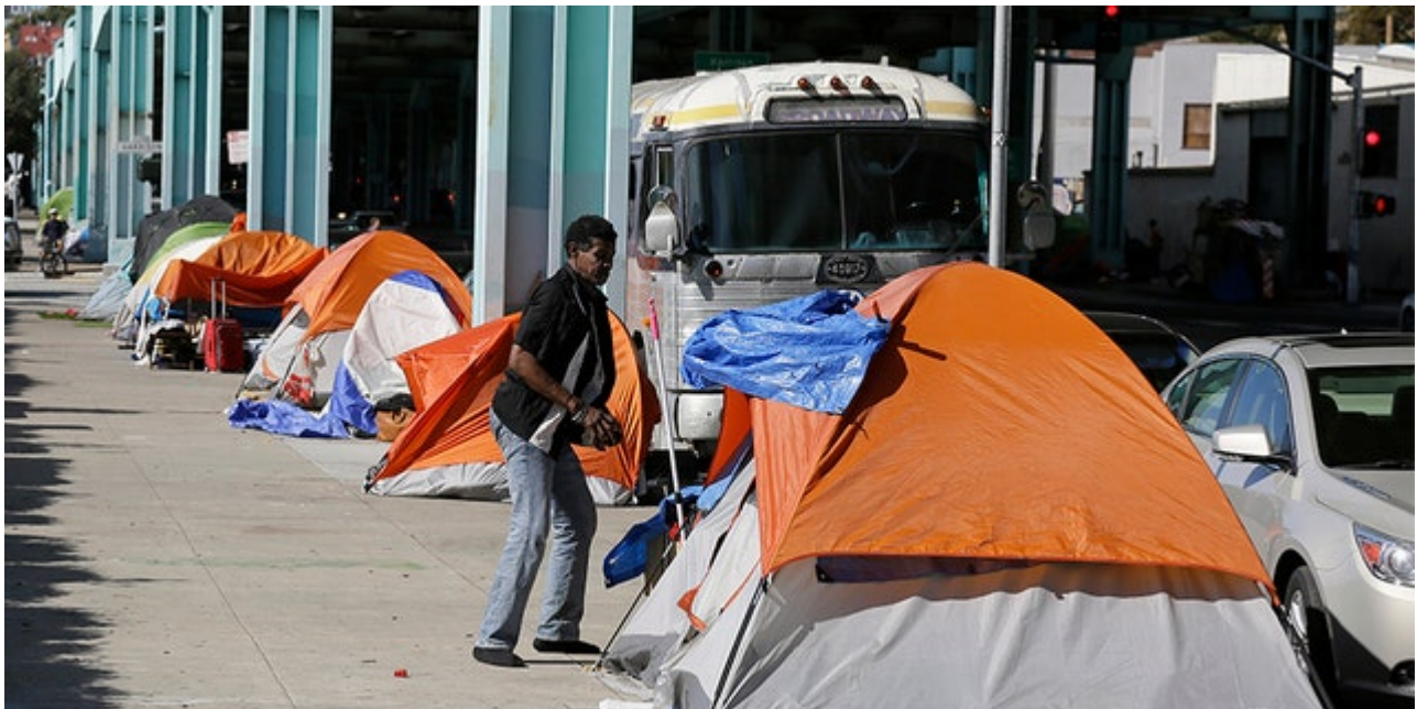
A man stands outside his tent on Division Street in San Francisco.

He added: “The intention was to help, of course, but what it really wound up doing is that it made San Francisco more attractive to those who are both homeless and those who are drug addicts to move here. We are now finding that homelessness is increasing. Drug addiction is increasing and the number of people here — the numbers are increasing, as well.”