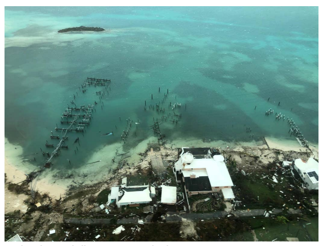
Social media / Michelle Cove / Trans Island Air