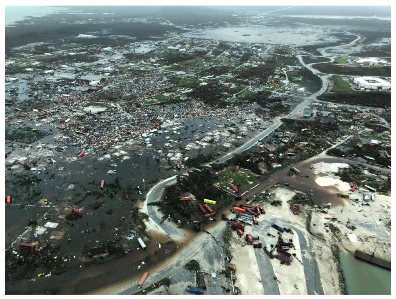
Social media / Michelle Cove / Trans Island Air