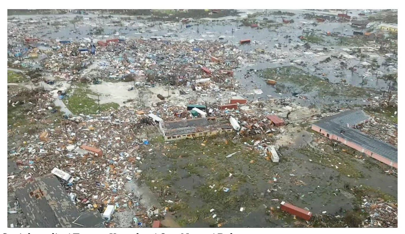
Social media / Terran Knowles / Our News / Bahamas