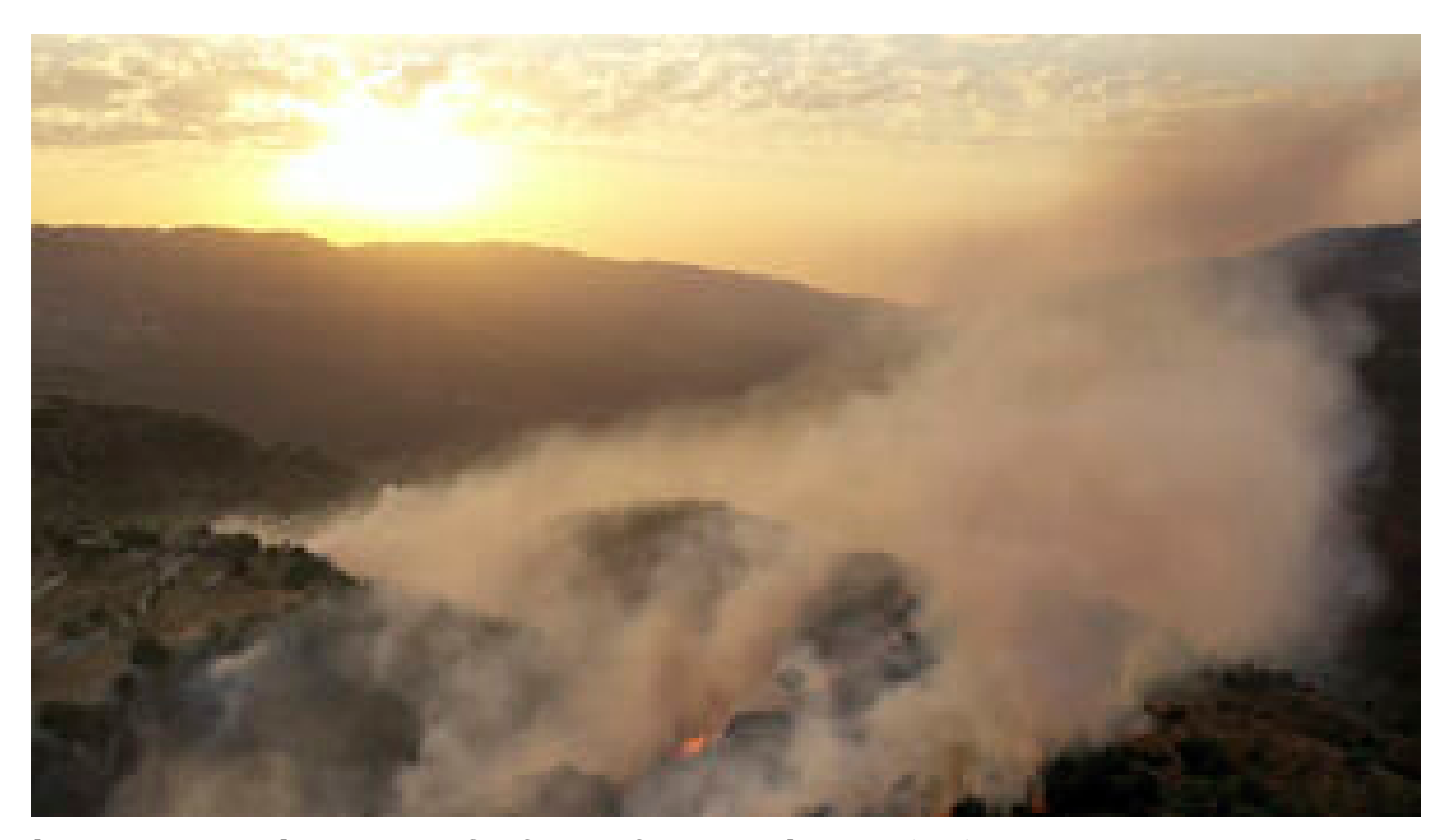
Flames rise at the scene of a forest fire in Lebanon

Wildfires around the Middle East triggered by a heatwave in the region have killed two people and forced thousands to leave their homes.