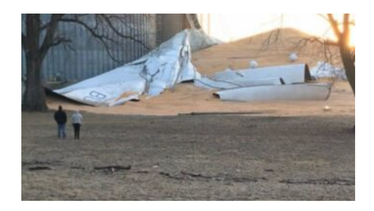
21,000t Grain Bin Collapses In US