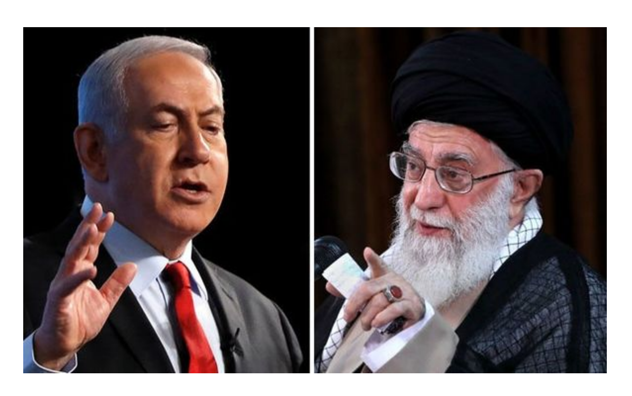
World war 3: Israel and Iran on brink of war